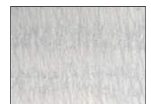
CORRECT APPLICATION = 20 dry gms/sqm