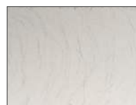
COVERAGE TOO LIGHT