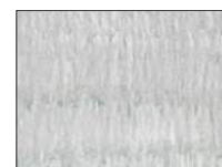
COVERAGE TOO HEAVY