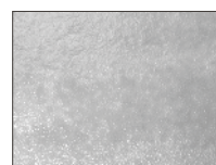
COVERAGE TOO HEAVY