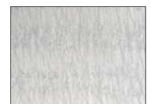
CORRECT APPLICATION = 20 dry gms/sqm