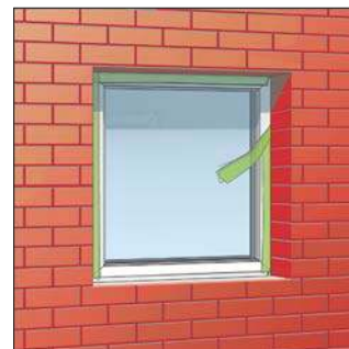
Fig. 2 Activate the expansion of TP601 Compriband e by removing the film and thread