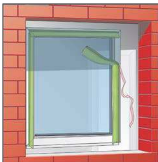
Fig. 1 Fix TP601 Compriband e onto the window frame using the self-adhesive backing

Safety data sheet must be read and understood before use.